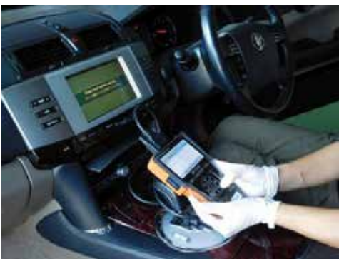
Scan tool is indispensable for future OBD vehicle inspection

the move, Inter Support Co., Ltd. says: "The expansion of coverage will help increase the use of scan tools. Until now, some businesses were not able to apply subsidy applications." A major service equipment trader also has a great interest in the expansion, "We hope to upgrades facilities in places of service providers. We want to offer scan tools to a wider range of service provider" ( Daily Automotive New, July 11 issue ).