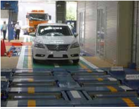
The entire administration will assist reconstruction efforts