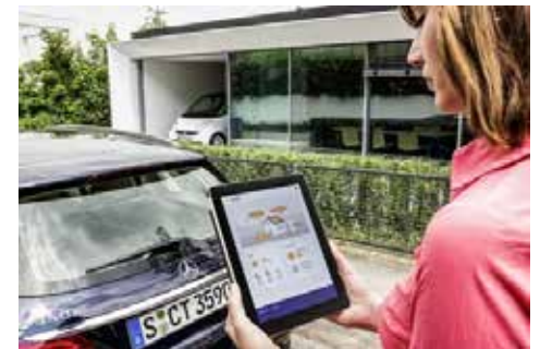
Added-value coming from big data

METI established "A Study Group for Ideal Approaches to Competition Policies for the Fourth