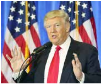
The world is watching President Trump