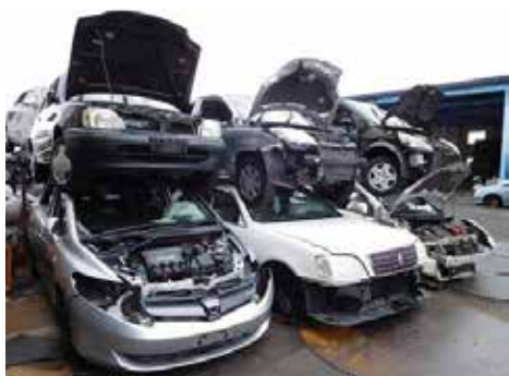
The fall in ELV acquisition continues

In the auto industry, vehicle behavior data has already used to analyze traffic congestion status and avoid accidents, as well as to anticipate failure thereby recommending repair. Big data of vehicle and customer is also essential for autonomous driving and ride sharing services. As such new businesses are expected to grow in our society, competition policy review will attract much more attentions. ( Daily Automotive News, January 19 issue )