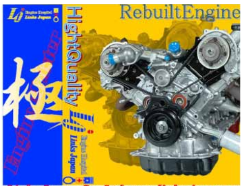
Links Japan Co., Lid www.links-jpn.com

Daikou's acquisition of ELVs, which from the base of the used parts business, totals 1,300 units monthly on average. Of the total, half of the sourced vehicles come from car dealers, and half from repair shops, body and paint shops (or light repair shops), used car dealers, auto insurers,