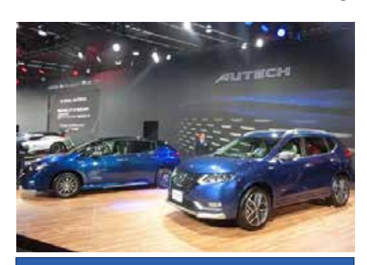
Nissan displayed their new X-Trail Autec (right) and LEAF Autec Concept

SUBARU Corporation displayed its Forester Advance Sports Concept and its Impreza STI Sports Concept, which were developed jointly with SUBARU Technical International (STI) Co. (Daily Automotive News, Jan. 12 issue)