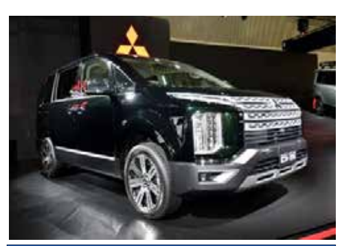
Mitsubishi's facelifted Delica D:5 was also on display