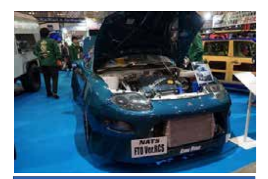
Students' dreams come true