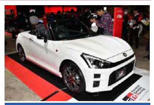
Toyota Group showcased the new Daihatsu Copen GR, etc.

Nissan Motor Co. and its subsidiary Autec Japan Inc. released its Nissan X-Trail Autec Edition on January 11. "We confirmed that even for SUVs, consumer trends exist towards luxurious interior design and high quality materials during the previous Tokyo Auto Salon," Autec said.