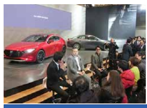
A talk session with chief engineer of Mazda3 was provided